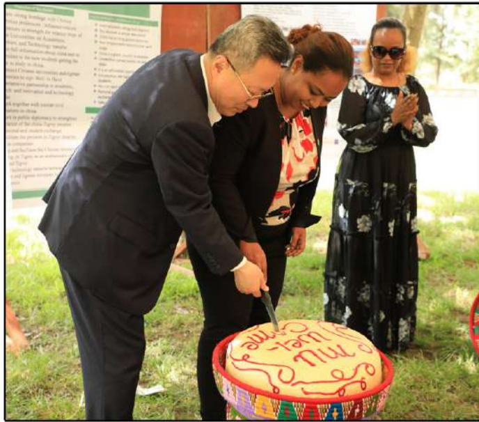
Chinese Ambassador visit to MU

It has also been striving hard to restore its Partnerships all over the world. The University has signed agreements and Memorandum of Understandings with many existing and new partners in the last one-year.