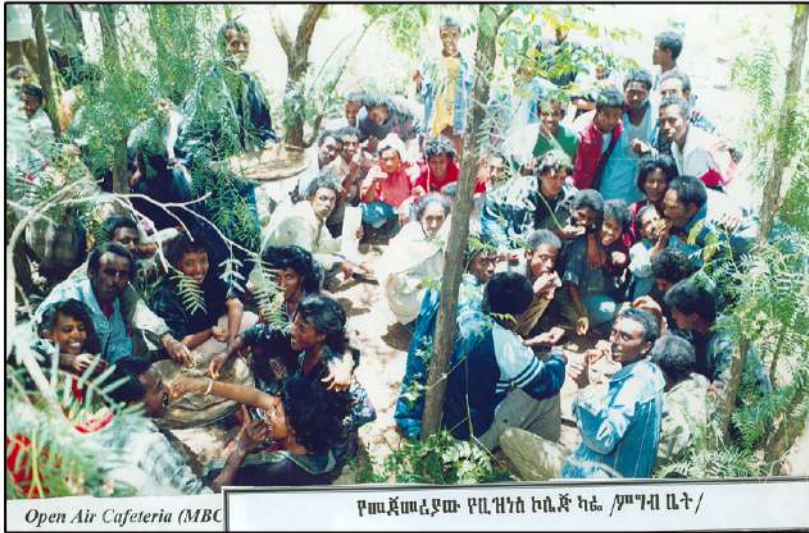
Open Air Cafeteria (MBC)