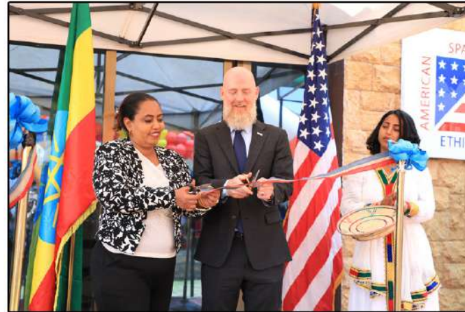
Opening ceremony of MU American Corner