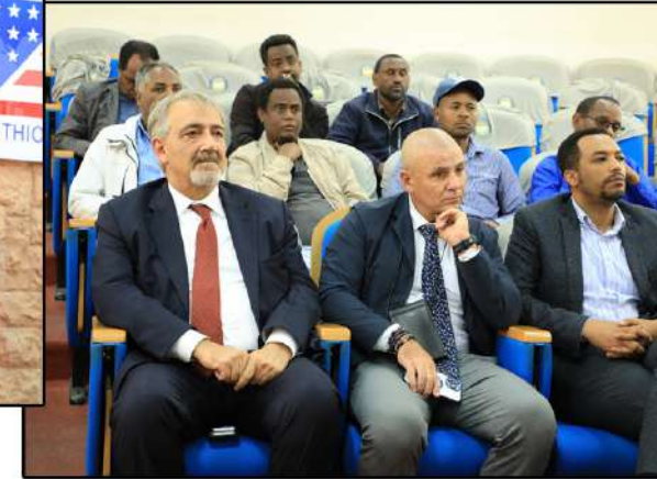
Collaborations with Italian Delegates