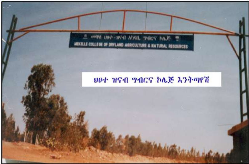
ህፀተ ዝናብ ግብርና ኮሌጅ እንትጣየሽ