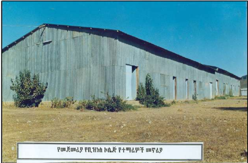
የመጽሐፍታዊ የቢዝነስ ኮሌጅ የተማሪዎች መኖሪያ